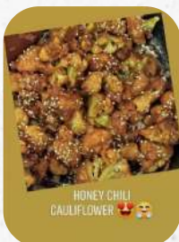
HONEY CHILI CAULIFLOWER